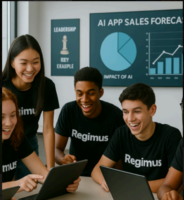
Ambassador Trainer ➔