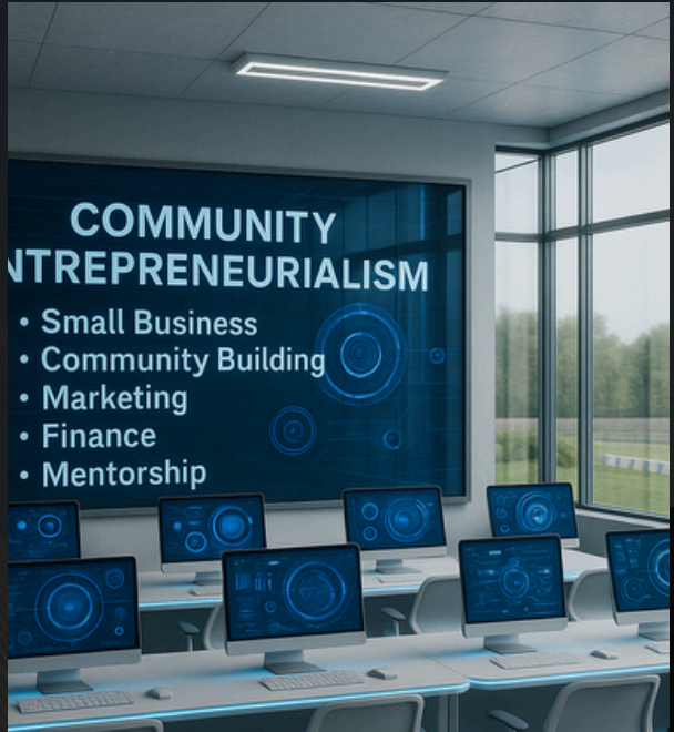
Digital Toolkits ➔