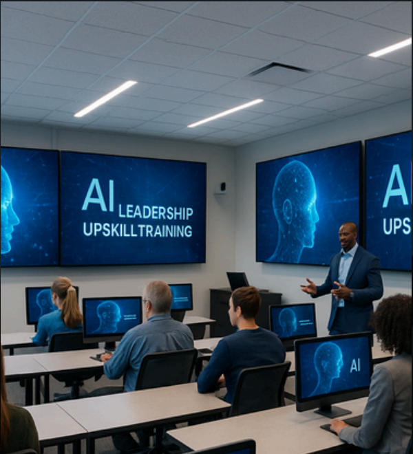
Training Center Programs ➔

Regimus offers flexible, career-focused programs that blend digital learning with hands-on training. Through our toolkits, in-person certification tracks, and Train-the-Trainer model, we equip students, families, and adult learners with practical skills in leadership, business, tech, and workforce readiness. Strategic partners can sponsor or scale these programs across schools and communities with measurable impact.