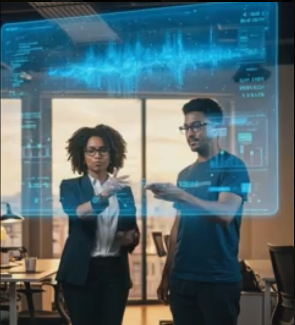
Strategic Partner Access ➔